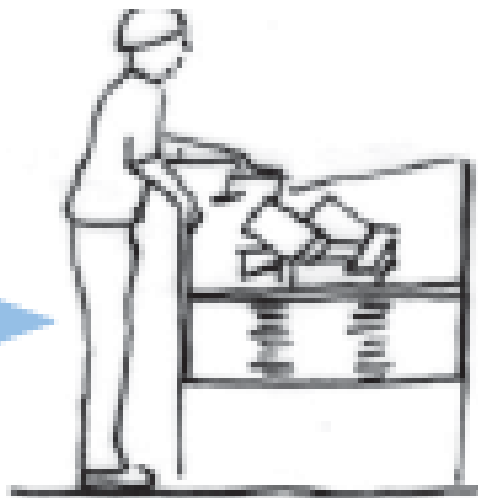
Drawing of construction worker standing to lift bricks off a table

Content from the MSD Prevention Guideline for Ontario, Book 3A (2008).